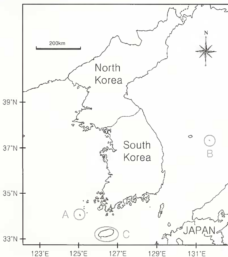
Figure 1. Map of South Korea and the locations of (A) Daegugul Island, (B) Dok Island, and (C) Jeju Island.

evidence of breeding in Russia: a dead juvenile was found in Boysman Bay in July 1984 (BirdLife International 2001).