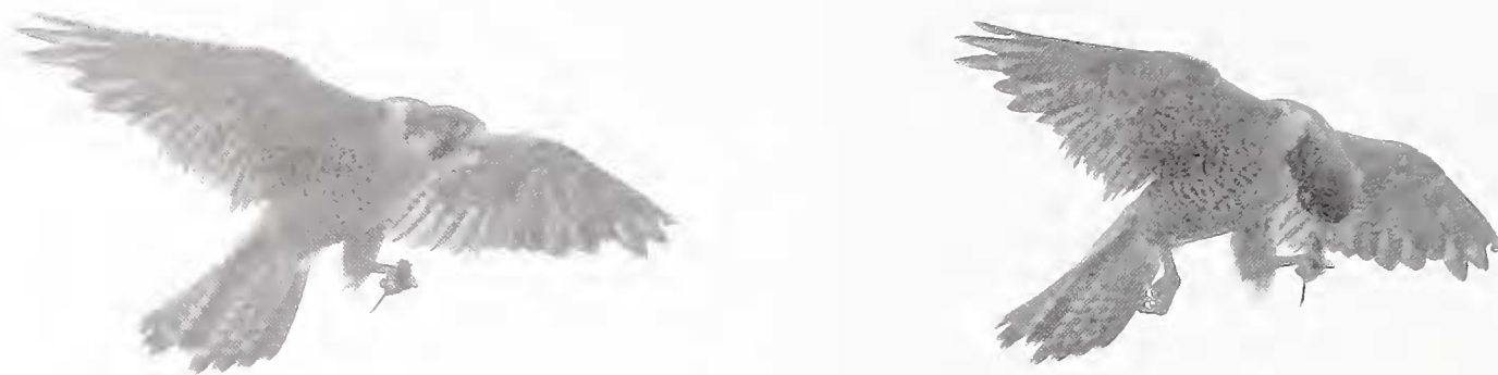
Figure 1. A Peregrine Falcon Falco peregrinus feeding on a dragonfly (Lesser Emperor Anax parthenope ) on Hongdo, Republic of Korea.

time of day. No such foraging was seen after 30 August, even though the survey continued right through the year.