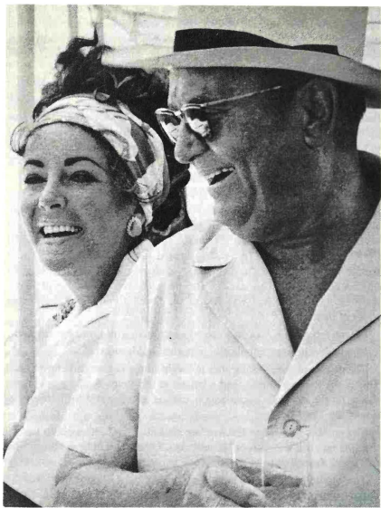
Elizabeth Taylor and the Yugoslav Tito